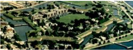
Interactive aerial Photo of Fort Monroe