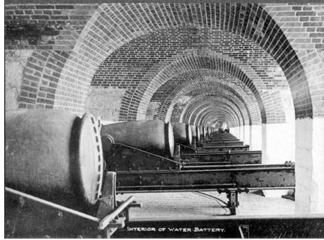
Water Battery at Fort Monroe